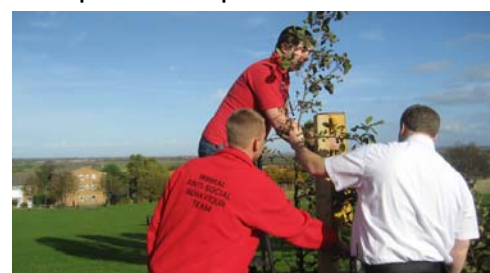
Grange Park, West Kirby

The Grange Park area of West Kirby saw environmental improvements led by the Friends of Grange Park residents' group with the planting of cherry trees and a lantern making workshop with children and young people. Tower Grounds in New Brighton saw local residents lead on an environmental audit with agencies. Work was undertaken in partnership with Leasowe Community Homes, taking the opportunity to speak with residents and young people attending the annual 'Unity in our Community' Halloween fancy dress party.